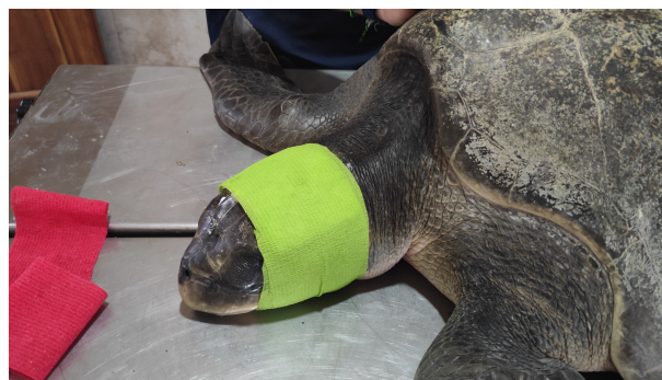
Figure 6: Turtle with skull injury

are placed in large tanks filled with sea water. Caregivers are on hand to provide treatment and care for their injuries. The turtles are most often injured by boats or fishing nets. Since the centre was set up, 600 turtles have been treated and released back into the sea. We had to take the turtles out of the tank, clean them, empty the water from the tank, clean the tank and then put the turtles back in the tank and refill it with sea water. In total there were 25 turtles in the centre. The last time we went to the centre we saw a turtle with a skull wound from a boat propeller being treated. The carer had to clean the wound and we were responsible for holding the turtle as it struggled in pain (figure 6).