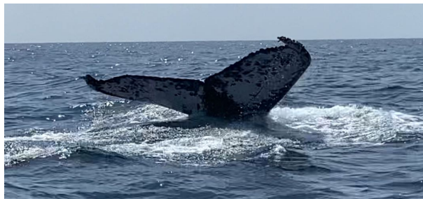
Figure 2: Tail of a whale