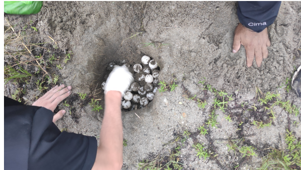
Figure 5: Turtle nest