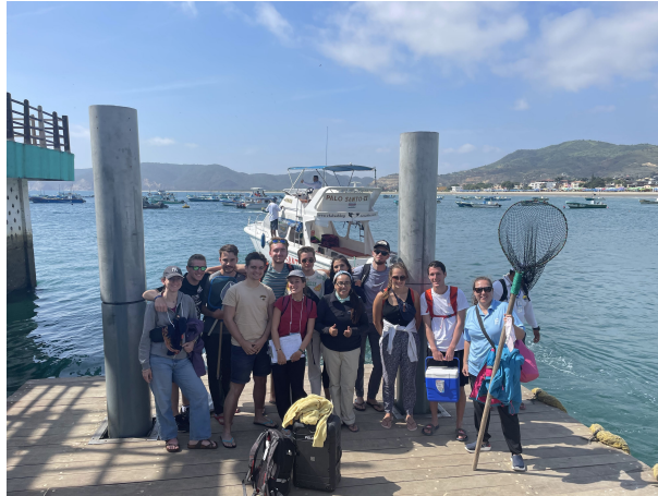
Figure 1: Our group and our boat in background